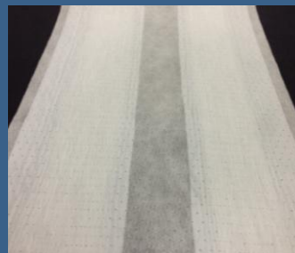
The glueless breathable laminate for back ears