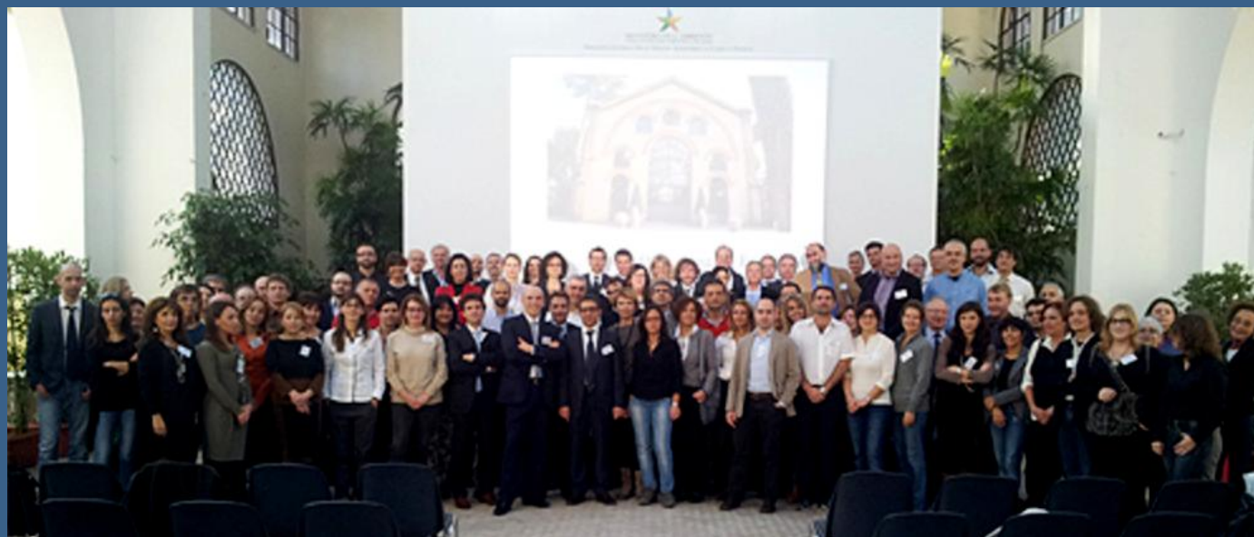
Group photo of the Italian recipients with the European Commission, the Astrale Timesis Monitoring Team and the National Focal points