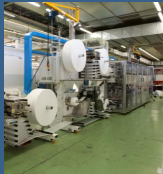
The Fameccanica FLS Lamination System

This "glueless" construction is now a commercially available solution with Fameccanica machine model FLS.