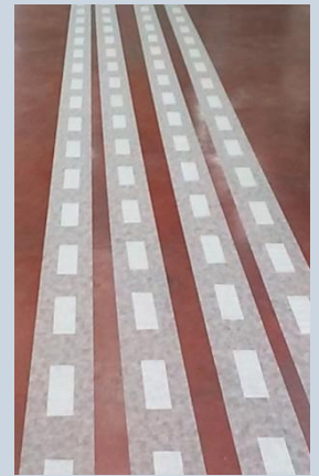
GLUELESS ADL samples displayed after the tests

The test will then continue with collateral activities of sealing pattern optimization.