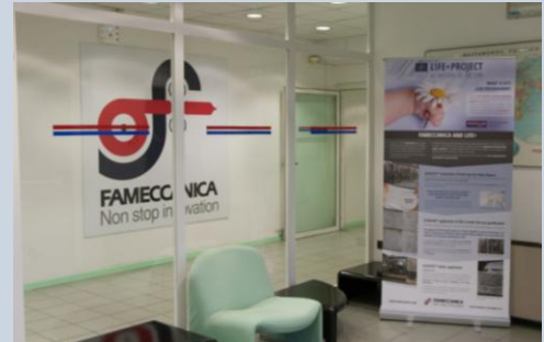
The new Notice Board displayed at entrance of Fameccanica Technical Department

The notice board is required by the EU commission as a project deliverable and has the aim to convey the essence of a specific LIFE project action, in this case, the Fameccanica ongoing project for environmental impact reduction in Absorbent Hygiene Products manufacturing.