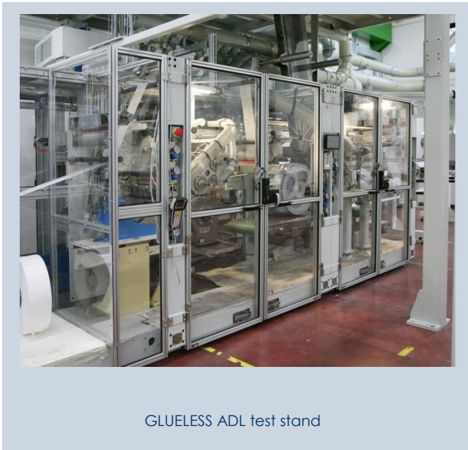
GLUELESS ADL test stand