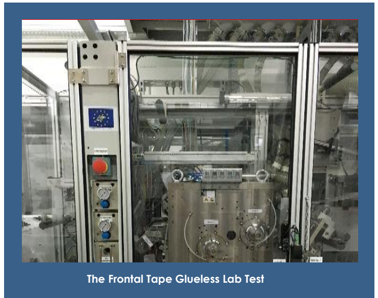
The Frontal Tape Glueless Lab Test