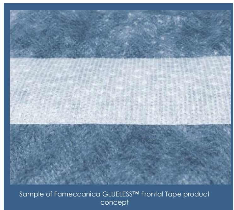
Sample of Fameccanica GLUELESS™ Frontal Tape product concept

The test will continue with additional raw material testing and with the engineering phase.